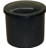
VC60L-22 Floating Ball