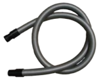
HBCOM-40 Complete Hose