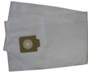
AF1086S Synthetic Dust Bag