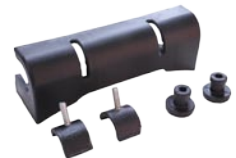
VC60L-HINGE Plastic Hinge