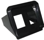
VC60L-10 Switch Stand