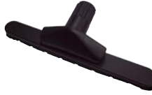
FTC140D Brush/Dry Floor Tool