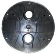
VC60L-19 Motor Base