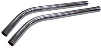
CSW040U - S Wand (Upper) CSW040L - S Wand (Lower) Sold Individually