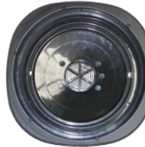
VC60L-20 Motor Base Frame