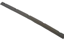
FTC140W-INSERT Replacement Squeegee Strip