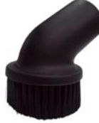
DBB040 Dusting Brush