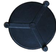
VC60L-18 3 Leg Cover