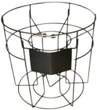
VC60L-23 Floating Rack