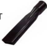
CT040 Crevice Tool