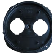
VC60L-14 Fixed Motor Cover