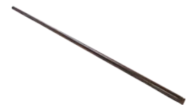
VC60L-AXLE Back Wheel Axle