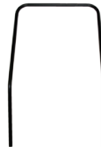
VC60L-29 Tank Handle