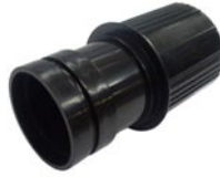
ME30/60 Machine End