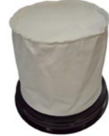
CB60 Cloth Bag