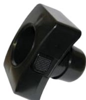
VC30L-27 Square Connector Tank