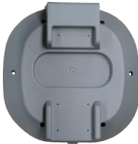
VC60L-2 Top Cover