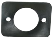
VC30L-26 Square Connector Gasket Seal