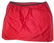
SILK-L Silk Filter Gown