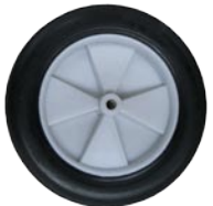
VC60L-31 Rear Wheel