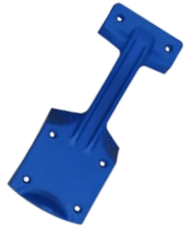
VC60L-1 Top Handle