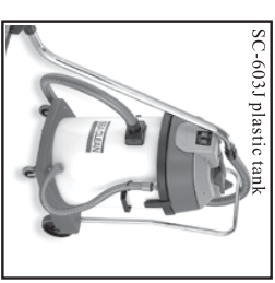
SC-603J plastic tank