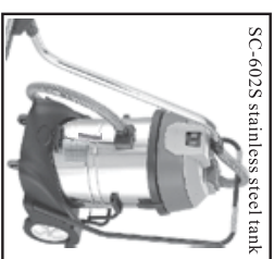
SC-602S stainless steel tank