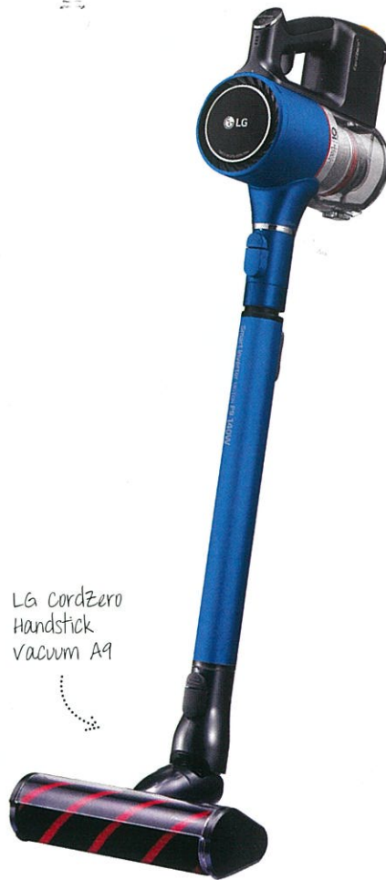
LG CordZero Handstick Vacuum A9

AEROSCIENCE UTILISES POWERFUL MINI WHIRLWINDS OF AIR TO SEPARATE OUT DUST PARTICLES WHILST THE LG INVERTER MOTOR ROTATES AT HIGH SPEED, CREATING RAPID AIR FLOW INSIDE THE VACUUM'S CYCLONE CHAMBERS.