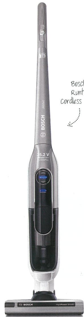
Bosch Athlet Runtime Plus cordless vacuum

Ecovacs Ozmo mopping technology in the Deebot Ozmo 930 and Deebot Ozmo Slim delivers both vacuum and mopping capabilities. Paired with the Ecovacs app, users can set cleaning schedules, select cleaning modes and monitor the cleaning process. The Deebot robovac are compatible with Google Home and Amazon Echo for voice control. AR